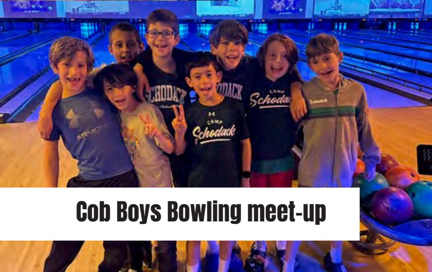
Cob Boys Bowling meet-up