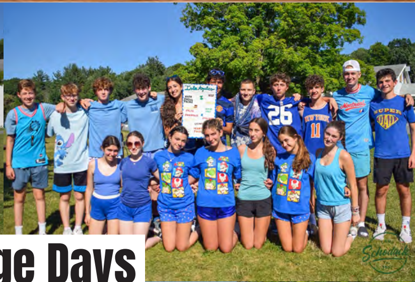
LT Challenge Days